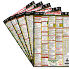
Alpha Minor Linking Charts (Set of 4 Charts) Criminal Minor Laws Civil Minor Laws Alpha Linking Doctrines Legal Maxims