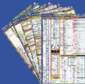
Alpha Minor Amendment Linking Chart