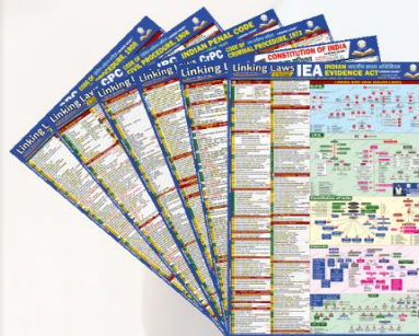
Major Laws Linking Chart