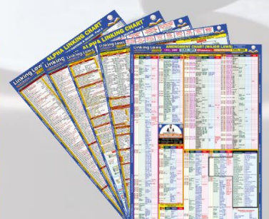
Alpha Minor Amendment Linking Chart