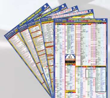
Alpha Minor Amendment Linking Chart