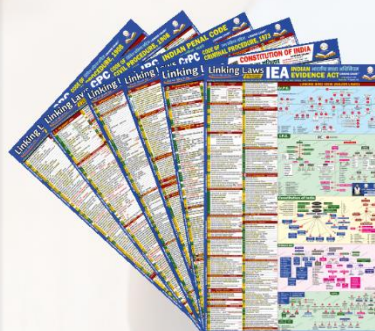
Major Laws Linking Chart