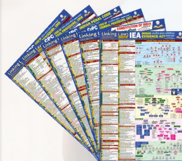
Major Laws Linking Chart