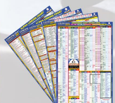
Alpha Minor Amendment Linking Chart