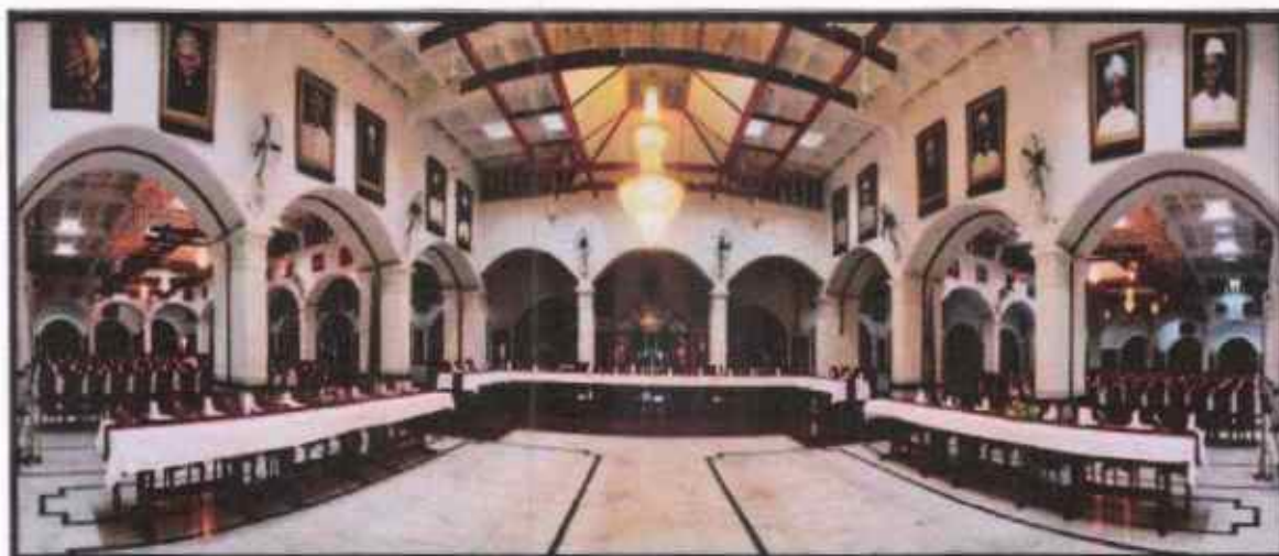
An Inside view of Yodha Cadets' Mess

17.3. Amenities. The Academy has the following facilities within its premises and is in the process of further improving the quality of life of Officer Cadets :-