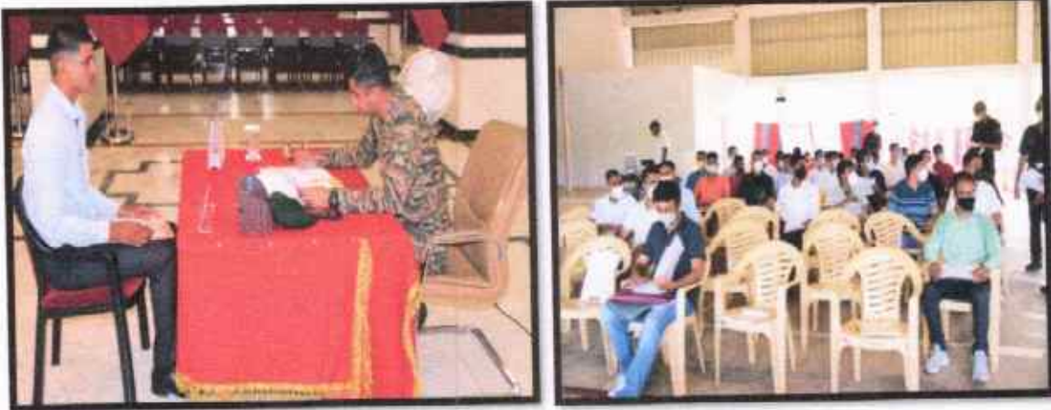
Reception at the Academy

9. Settling Down. On arrival, the Officer Cadets will be exposed to a disciplined military environment much different from civilian way of life. The stresses and strains experienced initially are part of the settling down process. The military, physical, psychological and moral training imparted at OTA is structured to achieve minimum acceptable standards for an all-round development of the trainees thus transforming them into the young officers of the Indian Army.