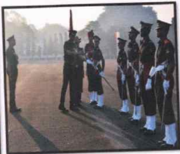
Passing Out Parade