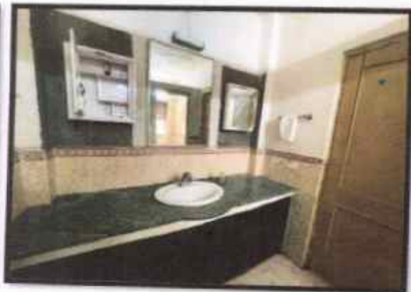
Officer Cadet's Model Room

17.2. Yodha Cadets' Mess. Yodha Cadets' Mess caters for the meals and other nutritional needs of the entire Academy. Officer Cadets are provided all three meals at the Mess at laid down timings as per schedule. In addition to the meals, the mess provides the bed tea, morning tea and refreshments in the afternoon to the Officer Cadets at their respective company locations.