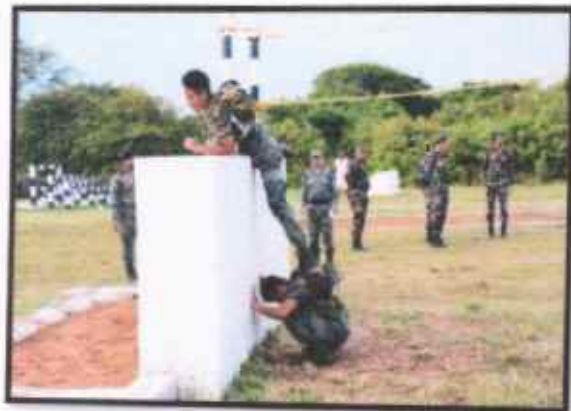
Officer Cadets during Sports and Obstacle Training