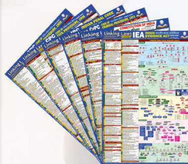
Major Laws Linking Chart