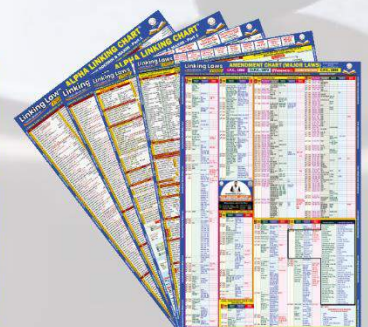
Alpha Minor Amendment Linking Chart