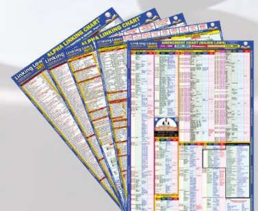
Alpha Minor Amendment Linking Chart