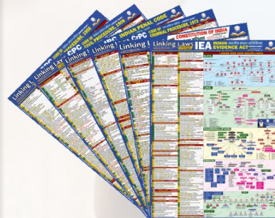
Major Laws Linking Chart