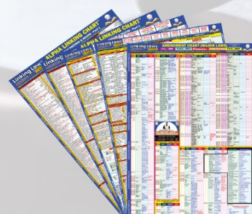
Alpha Minor Amendment Linking Chart