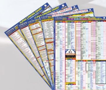
Alpha Minor Amendment Linking Chart