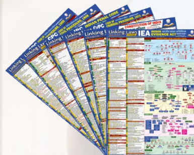
Major Laws Linking Chart