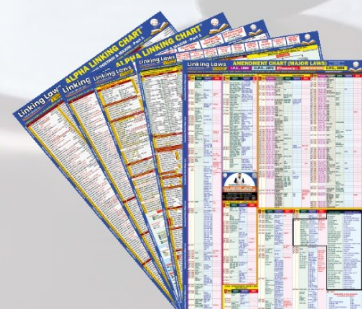
Alpha Minor Amendment Linking Chart