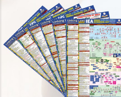
Major Laws Linking Chart