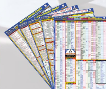
Alpha Minor Amendment Linking Chart