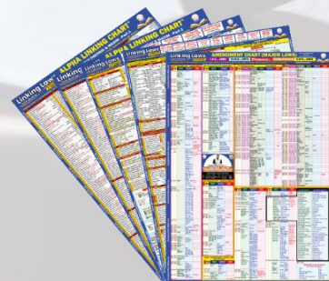
Alpha Minor Amendment Linking Chart