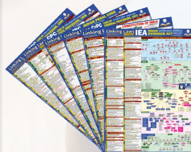
Major Laws Linking Chart