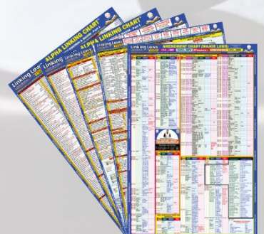
Alpha Minor Amendment Linking Chart