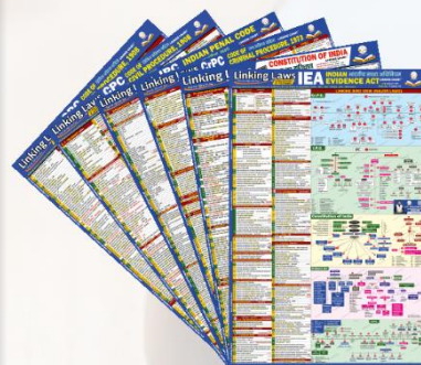
Major Laws Linking Chart